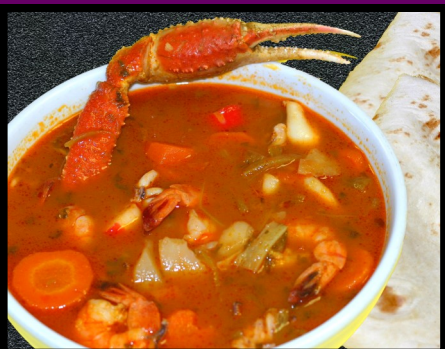
Caldo 7 Mares* $22.99

Shrimp, fish, scallops, calamari, clam, octopus, and one (1) crab leg.