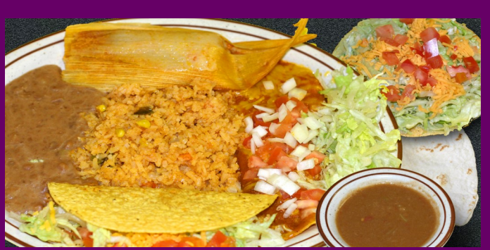
Los Volcanes Special ..... $16.95 Chicken taco, guacamole tostada, pork tamale, beef enchilada, rice, beans, green chile, and one (1) tortilla