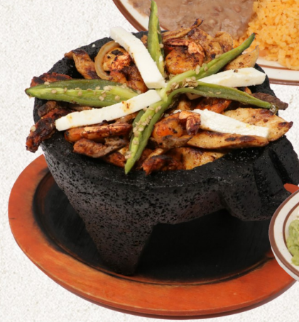
Molcajete Cielo, Mar y Tierra

Trio Mexicano .....$25.99 Three bacon wrapped shrimp, steak, chicken, rice beans and two (2) tortillas.